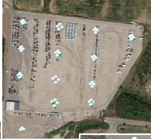
Actual LeafNut software views